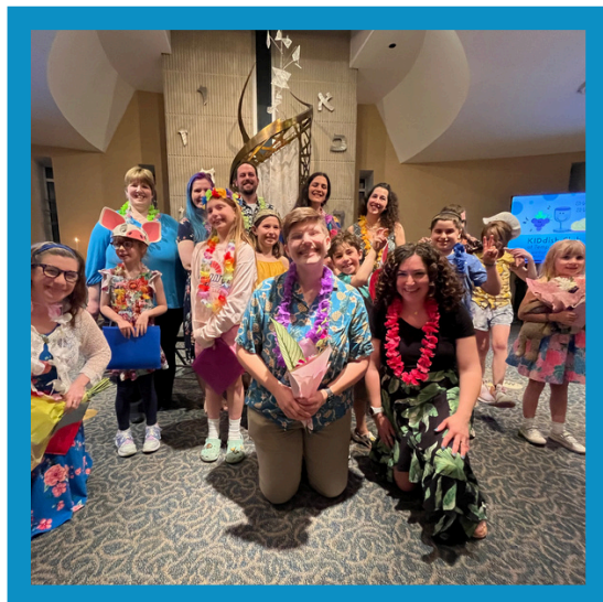
Yashev Koach to our Purim Spiel performers for another fun and festive spiel!