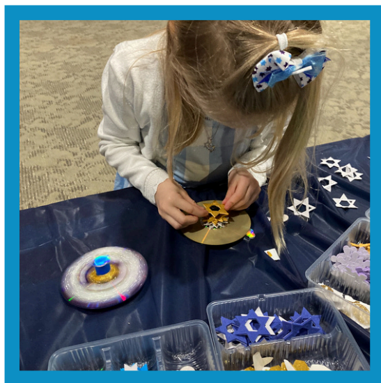
During our annual Chanukah dinner and service, children decorated CD dreidels.