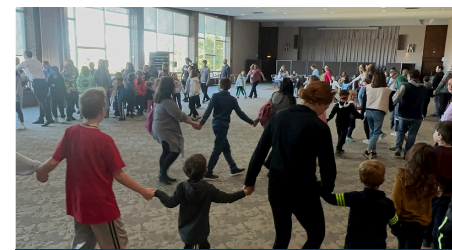
Torah Center students and their families celebrated Simchat Torah.

We are always collecting non-perishable food donations for SHIM in the boxes beside the stairwell.