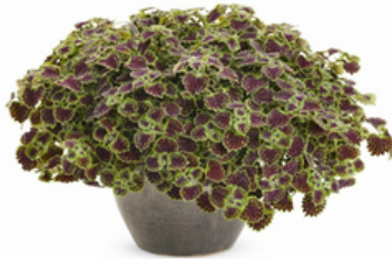
# _____ Coleus Spring Mix Morning sun/PM shade Trailing coleus with begonia planted in the middle

Non-stop begonias, blue torrenia, creeping Jenny