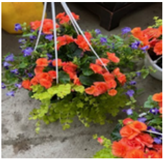
# _____ Spring Mix Shade

Non-stop begonias, blue torrenia, creeping Jenny