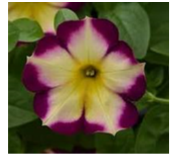
# _____ Banana Cherry Petunias Sun Bi-color yellow and purple flowers