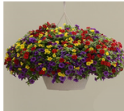
# _____ Million Bells Sun Mixed colors, small petunia-type flowers