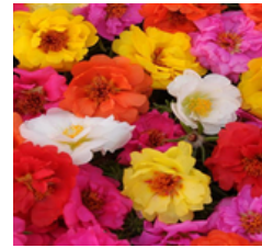
# _____ Portulaca Mix Sun Mixed colors