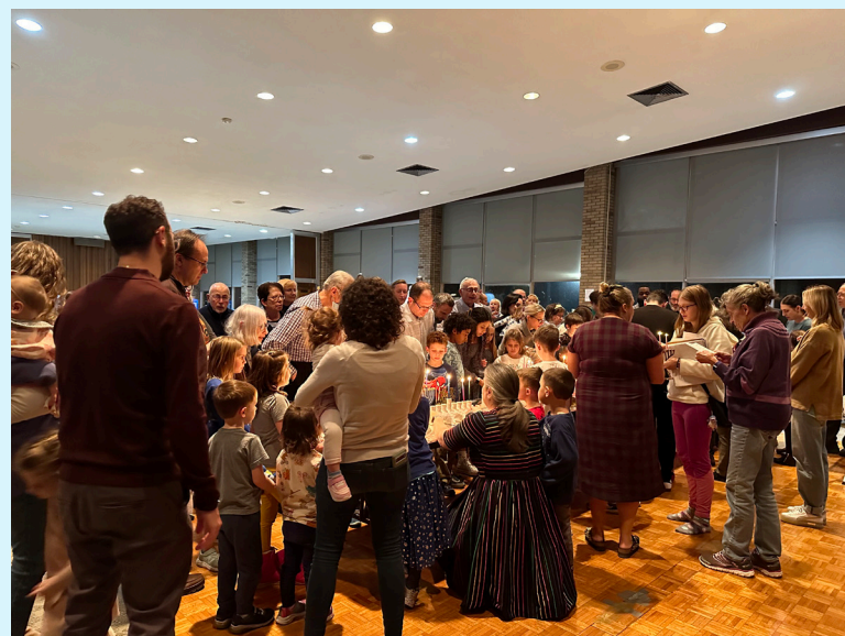
2023 Chanukah Dinner