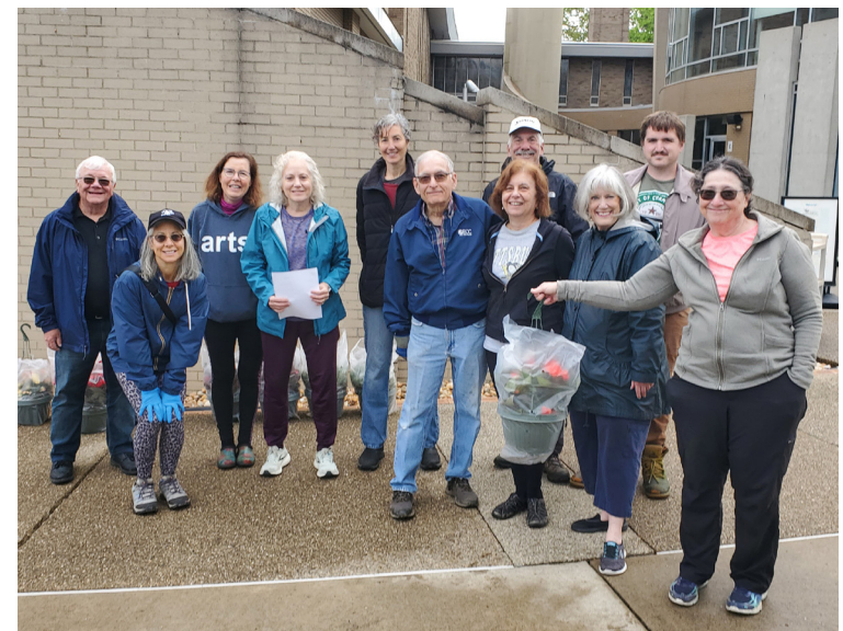
Kudos to our volunteers who helped sort over 700 plants into orders for our spring plant sale!