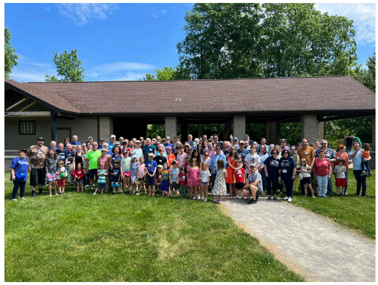
...And at our Memorial Day Bagel Brunch!