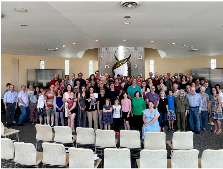
We had a great turnout for our Annual Meeting on June 4th!