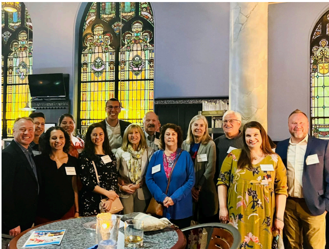
Temple Emanuel at our community partner SHIM's Annual Gala