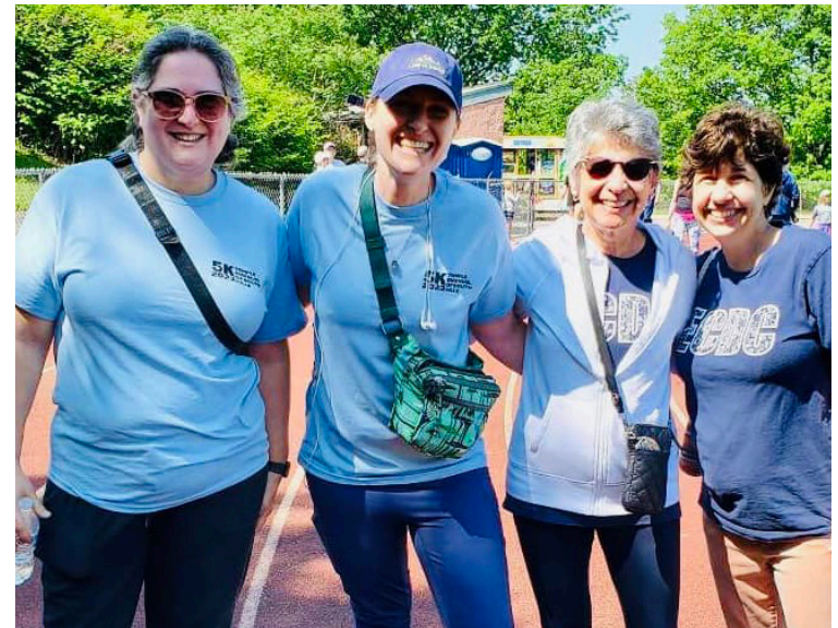
Smiles all around as we raised $1500 at Temple's 5K Run/Walk for SHIM!