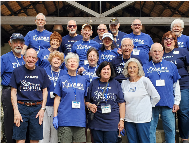
Many thanks to our TERMS volunteers who coordinated our Memorial Day Bagel Brunch.