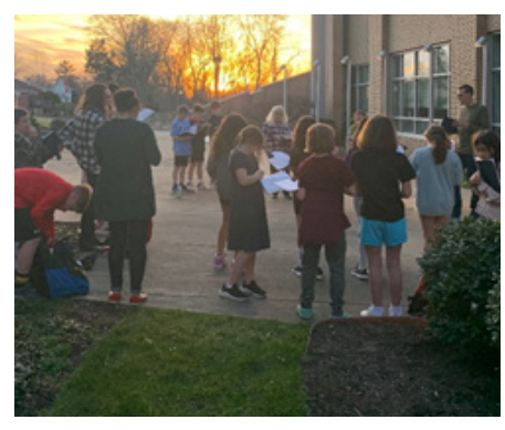
Outdoor T'filah with our mid-week Our 6th grade students and Hebrew students

Keep an eye on your inbox for information pertaining to registration for next year. Not currently enrolled in Torah Center, but have questions on enrolling your child in our program (PreK - 7th) for the 23-24 school year? Please reach out to me at smcferron@templeemanuelpgh.org.