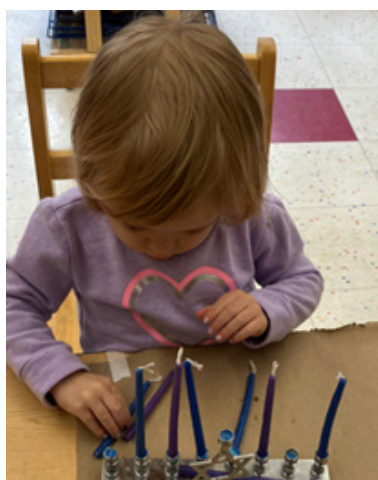
A two year old practices lighting the candles