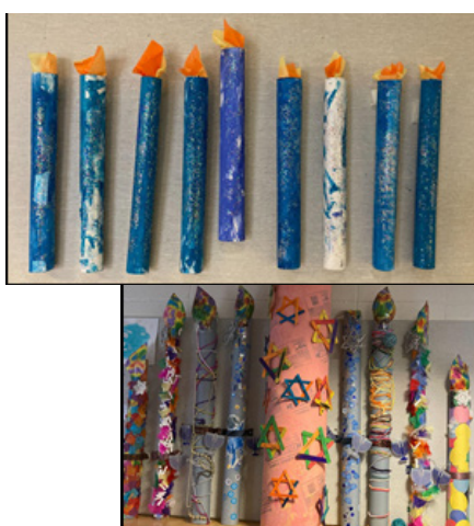
Class created chanukkiot