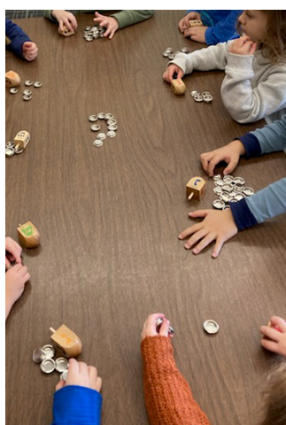
A dreidel game in progress